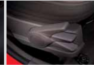
Driver Seat Height Adjuster

The Next Gen i10 is simply irresistible and speaks volumes about class and innovation from every angle. The first-in-class turn indicators on the outside mirrors with heated function, the electric adjustable mirrors and electric sunroof lend a touch of luxury to this Next Gen phenomenon. While the automatic transmission ensures a hassle free drive, the bluetooth connectivity, steering wheel remote, USB port and driver seat height adjuster make the drive convenient, providing ultimate driving pleasure.