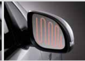
Electric Heated and Adjustable Outside Mirror