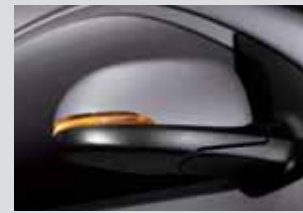
Outside Mirror Turn Indicators