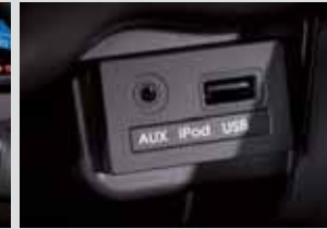
Aux and USB Ports