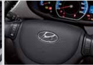
Steering Audio and Bluetooth Control